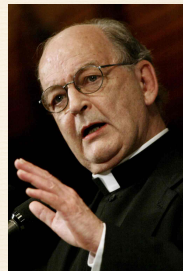
Richard John Neuhaus

We don't disagree, we just have verbal food fights where we talk over each other and where only our supporters are listening or understanding."